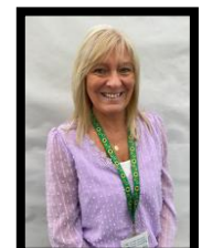
Mrs Quinn Support Assistant

We often have students from the following courses on placement in the nursery: